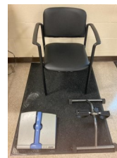
Stationary stepper & stationary peddles