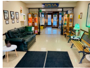
NEW, Cozy Welcoming Summer Foyer