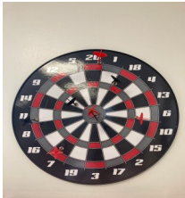
New Dart Board