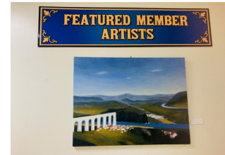
Displaying Member Artwork

Here are a few UPDATES that I wanted to share with you this month: