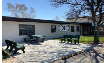
Park Benches OUT for Spring!