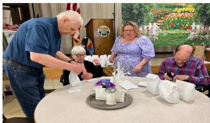
Packing bags for Friends of the Night People