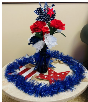
Stars & Stripes forever!