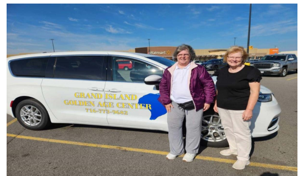
Going Places in our many transportation vans!