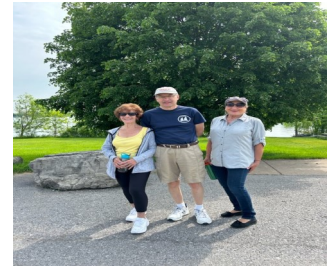
Wellness Walk at Spaulding Trail