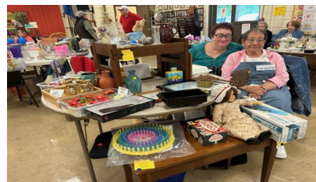
Gram's Garage Sale FUN!