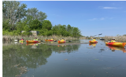
Kayaking at Woods Creek