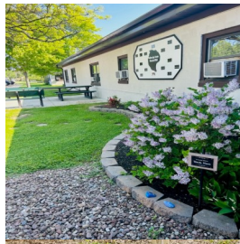
Trees in BLOOM on the Nike Base