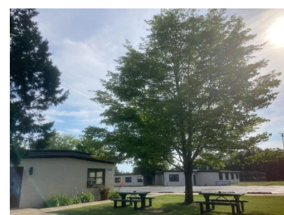
Sun shining on Lorraine Lane