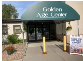
Welcoming Front Entrance