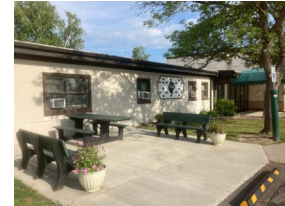
Picnic & Seating Area