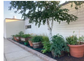
Veggie & Flower Garden