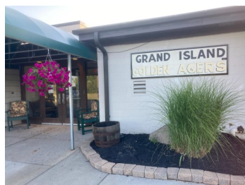
Parade Sign— Circa 1980