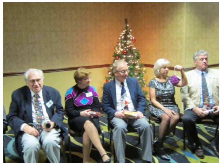
Lions examine their "gifts."