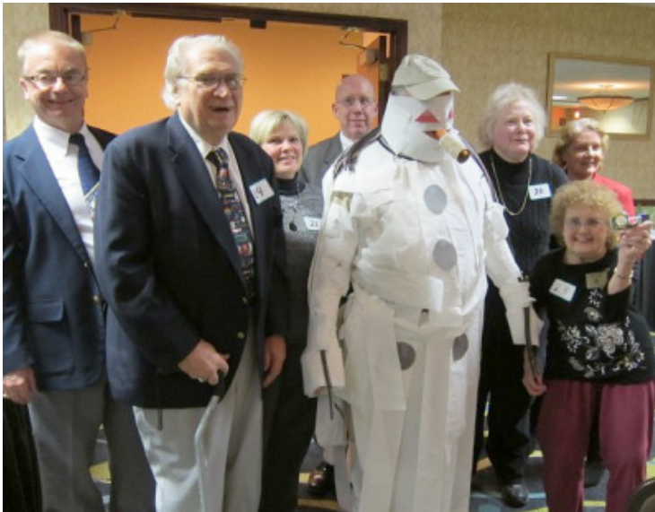
Lion Snowman Henry