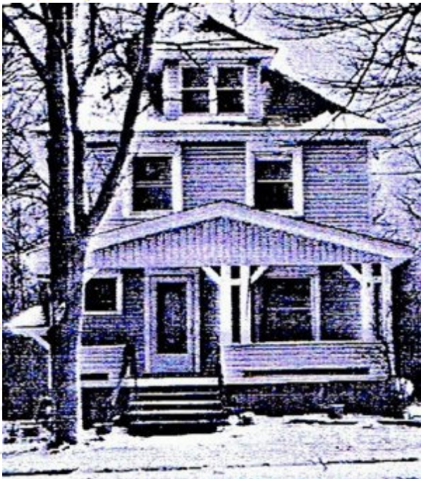
Picture of the family Justice Center

The Brandel-Murphy Youth Foundation has also provided past matching grants to us for the Miracle League playground, the annual Special Kids Picnic held at the Buffalo Launch Club, and the new playground at Sidway Elementary. All told, $13,000 obtained from the generous donations of local citizens to our club and matching grants from the Foundation have made life better for all kids who live and visit here. Once safe to do so (hopefully in June), work will commence to complete the rehabilitation of the center. At that time, the $3,000 funding will be released to the center.