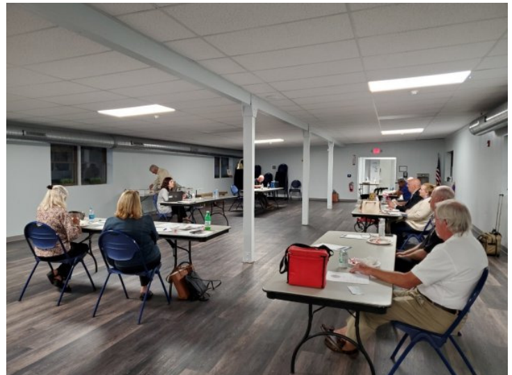
Lions Gathered at the Community Center on Whitehaven Rd for our September 22nd meeting. Check out upcoming events for similar meetings.