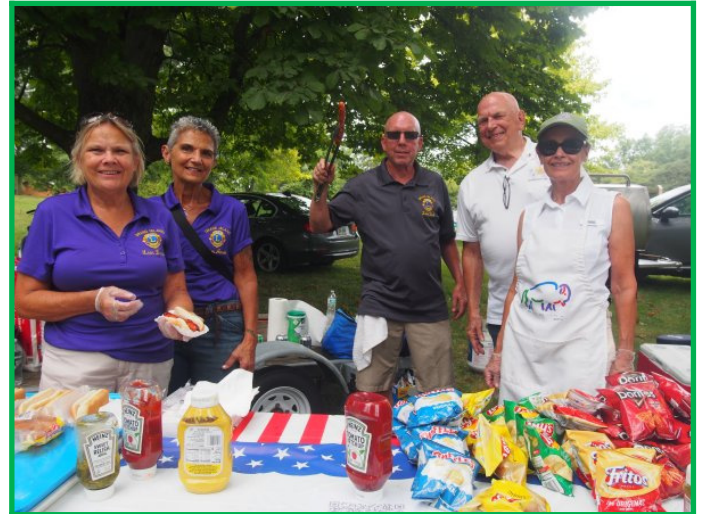
Lions Club members serve hot dogs at the annual Paddles Up event, held at Beaver Island State Park. This year's event was on July 26.