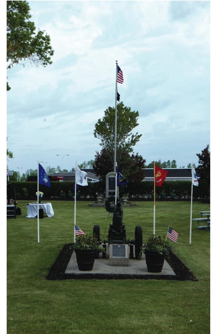
Town of Grand Island Memorial Day Ceremony Charles N. DeGlopper Memorial Park May 28, 2018 10:00 AM