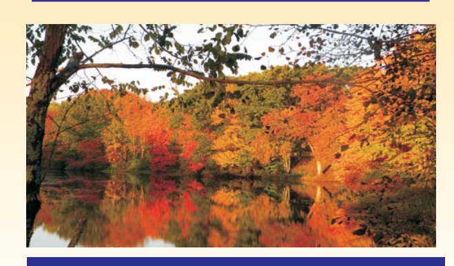
Copyright © 2013 Niagara River Greenway Commission

Website: www.niagaragreenway.org Email: info@niagaragreenway.org