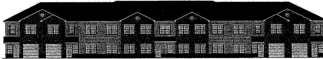
12 Unit Front Elevation

1955, 1959, 1963 Grand Island Blvd Town of Grand Island, Erie County, New York