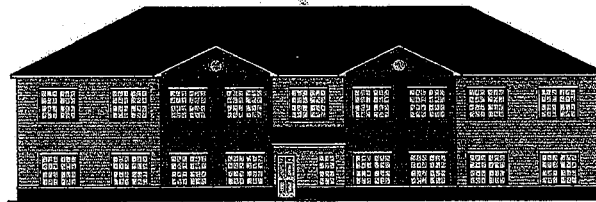
8 Unit Front Elevation