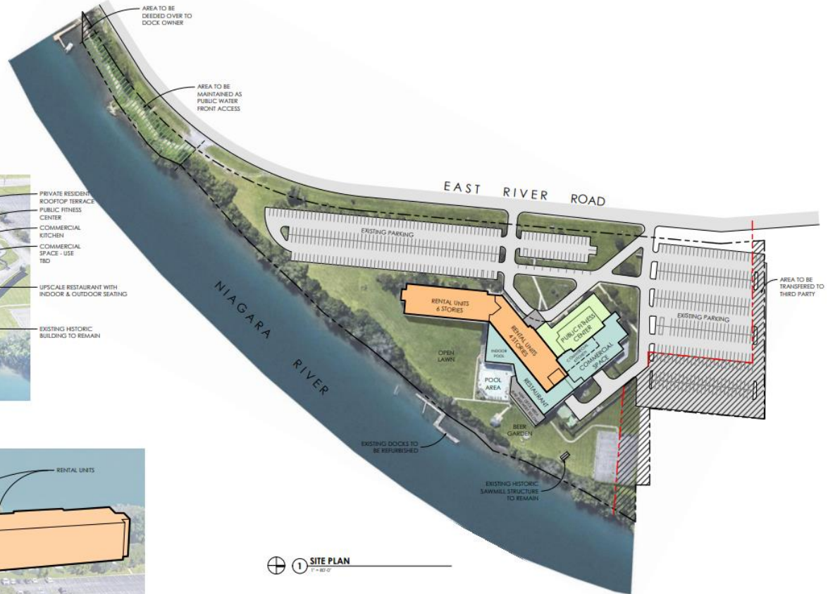
1 SITE PLAN 1" = 80' 0"