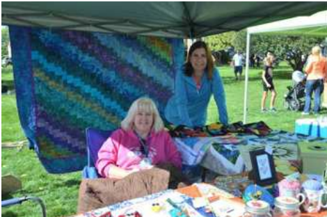
River Lea Quilters