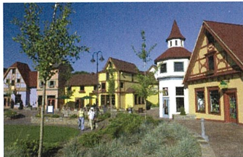
Frankenmuth Village Shops