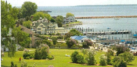
Picturesque Mackinac Island